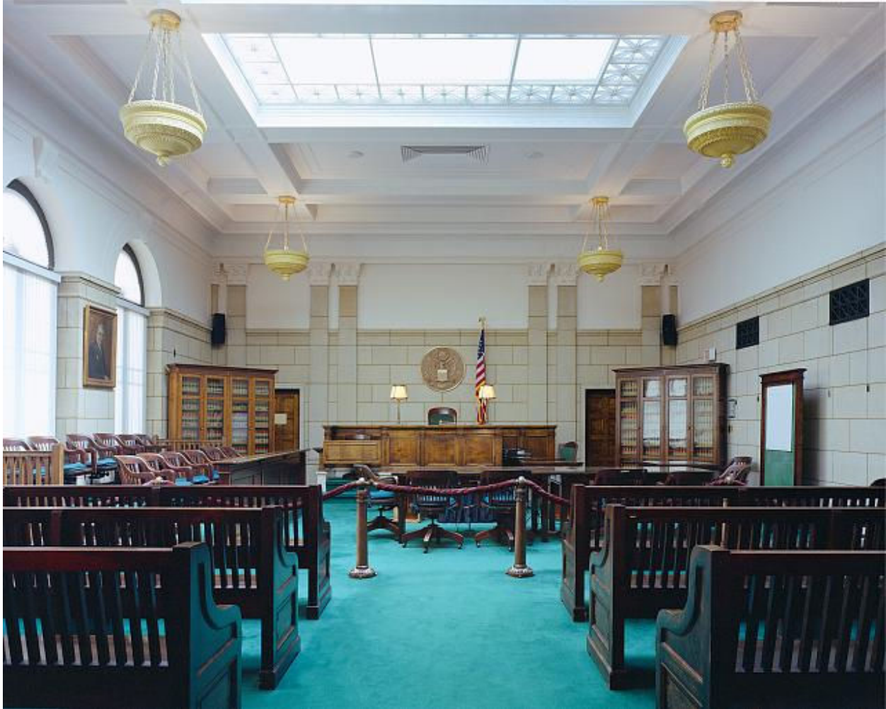
Courtroom The Gerald W. Heaney Federal Building Duluth, Minnesota Building completed in October 1930 Image taken September 23, 2005, by Carol M. Highsmith Source: Library of Congress