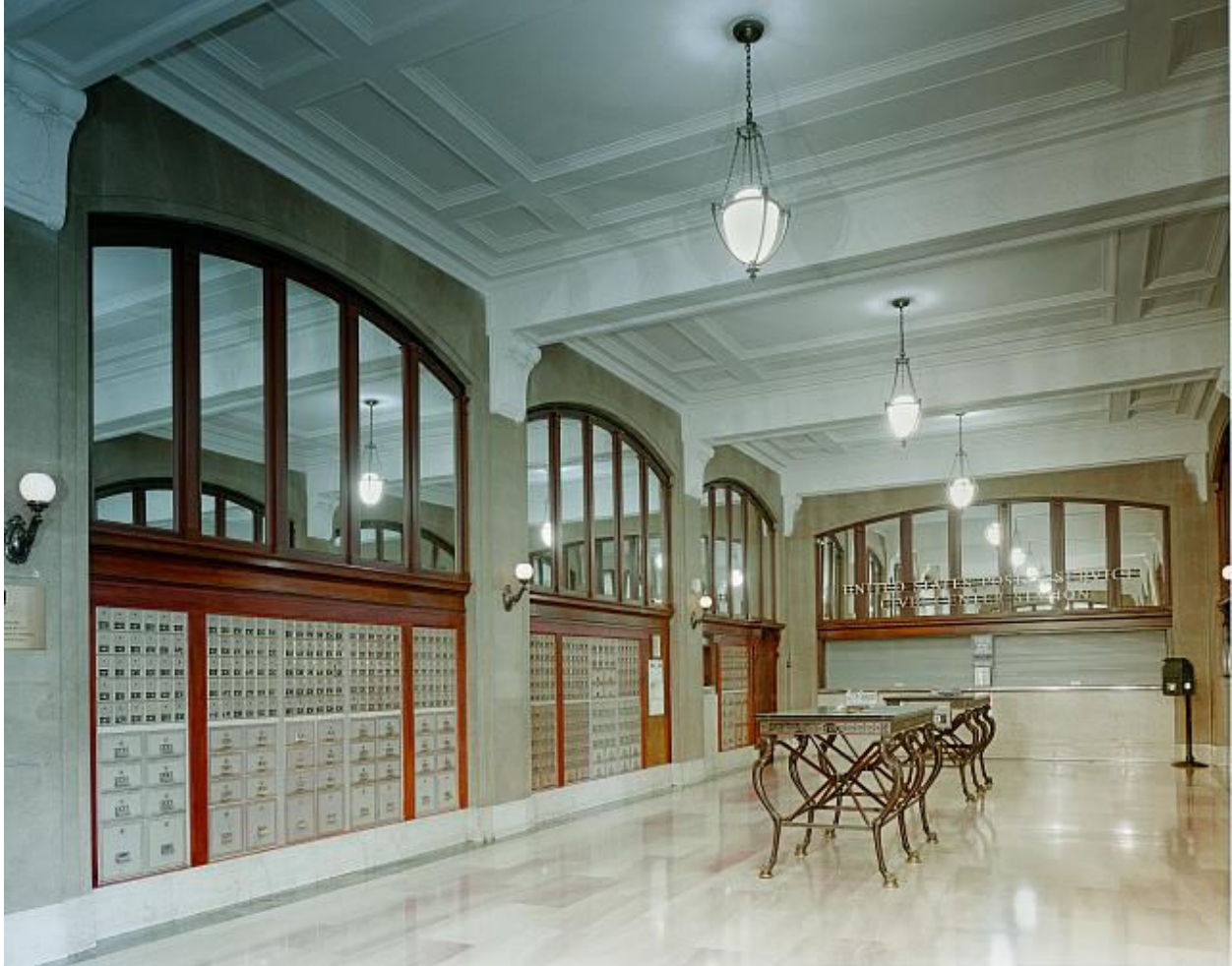
Post Office lobby The Federal Building, U.S. Courthouse & Custom House Duluth, Minnesota Image taken September 23, 2005, by Carol M. Highsmith Source: Library of Congress