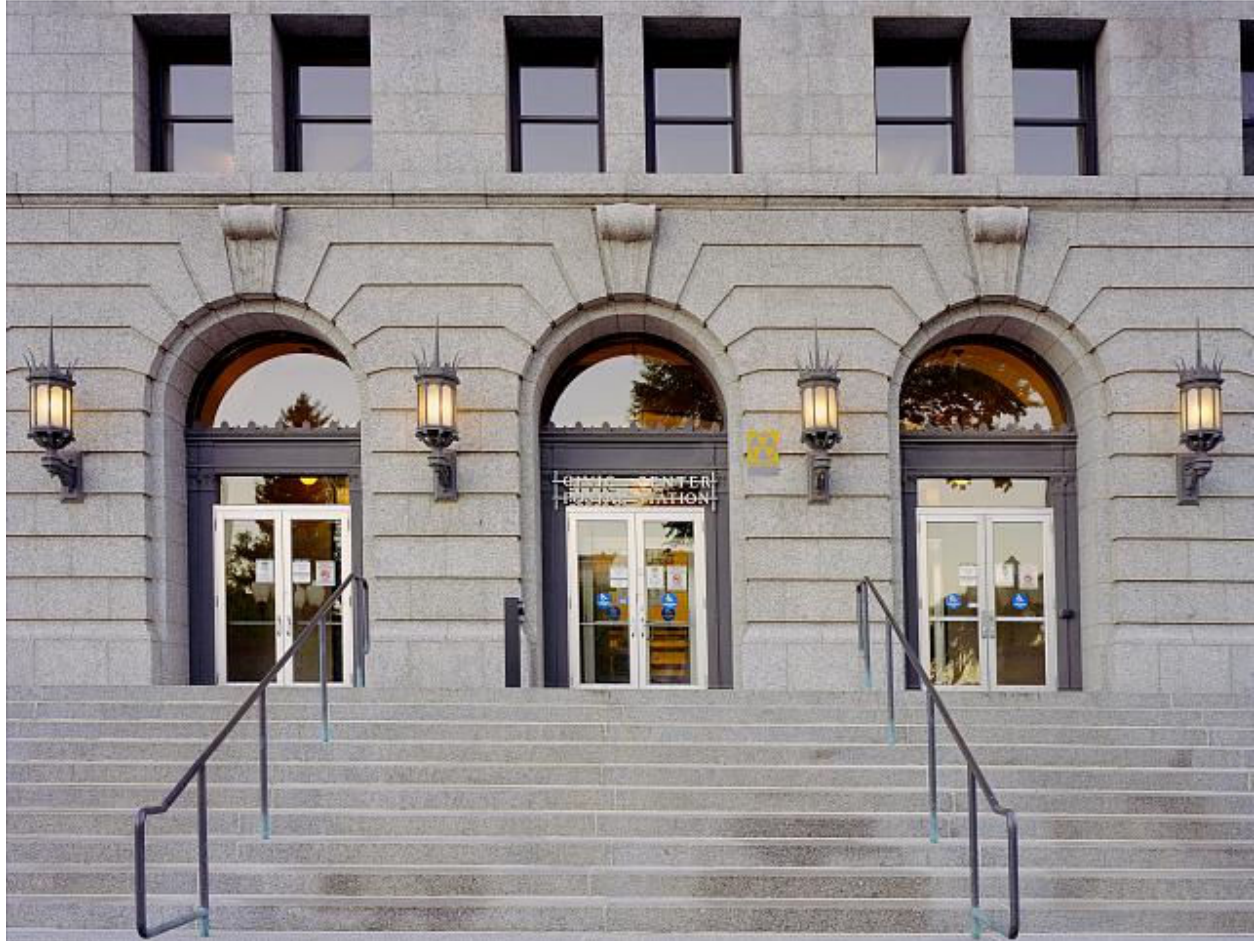
Front entrance of the Federal Building & U.S. Courthouse Duluth, Minnesota Architect: James A. Wetmore Building completed in October 1930 Image taken September 23, 2005, by Carol M. Highsmith Source: Library of Congress