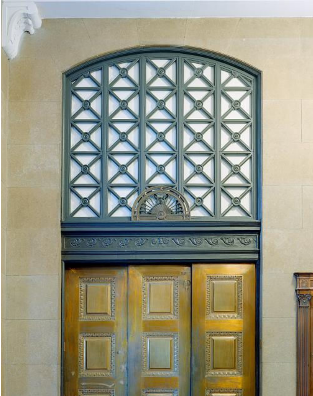
Elevator detail The Federal Building, U.S. Courthouse & Custom House Duluth, Minnesota Architect: James A. Wetmore Building completed in October 1930 Image taken September 23, 2005, by Carol M. Highsmith Source: Library of Congress