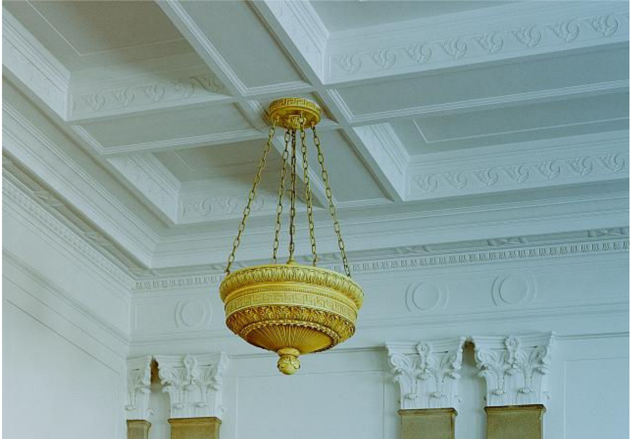
Interior courtroom light detail The Gerald W. Heaney Federal Building, U. S. Courthouse & Custom House Duluth, Minnesota Image taken September 23, 2005,