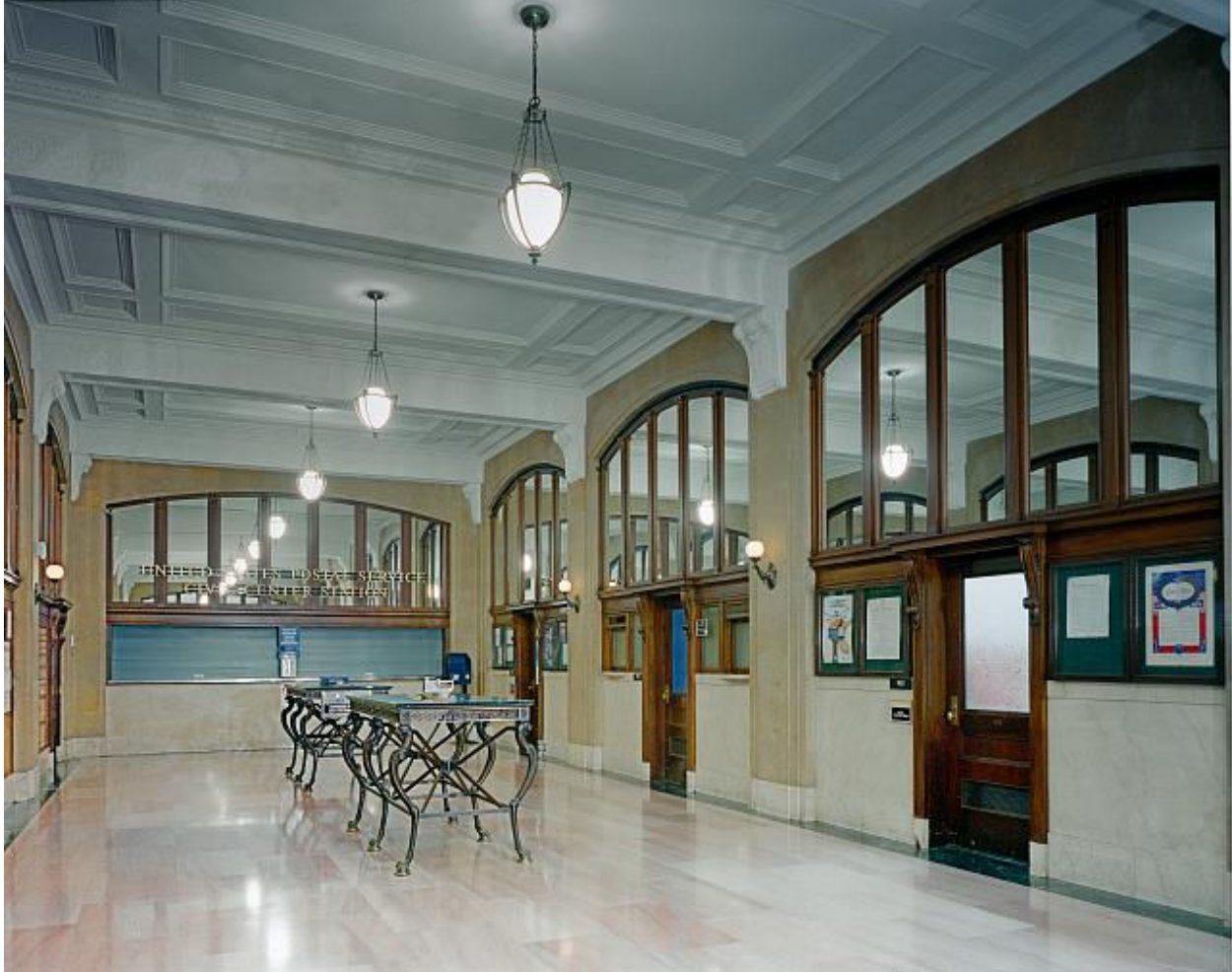
Post Office lobby The Federal Building, U. S. Courthouse & Custom House Duluth, Minnesota Image taken September 23, 2005, by Carol M. Highsmith Source: Library of Congress