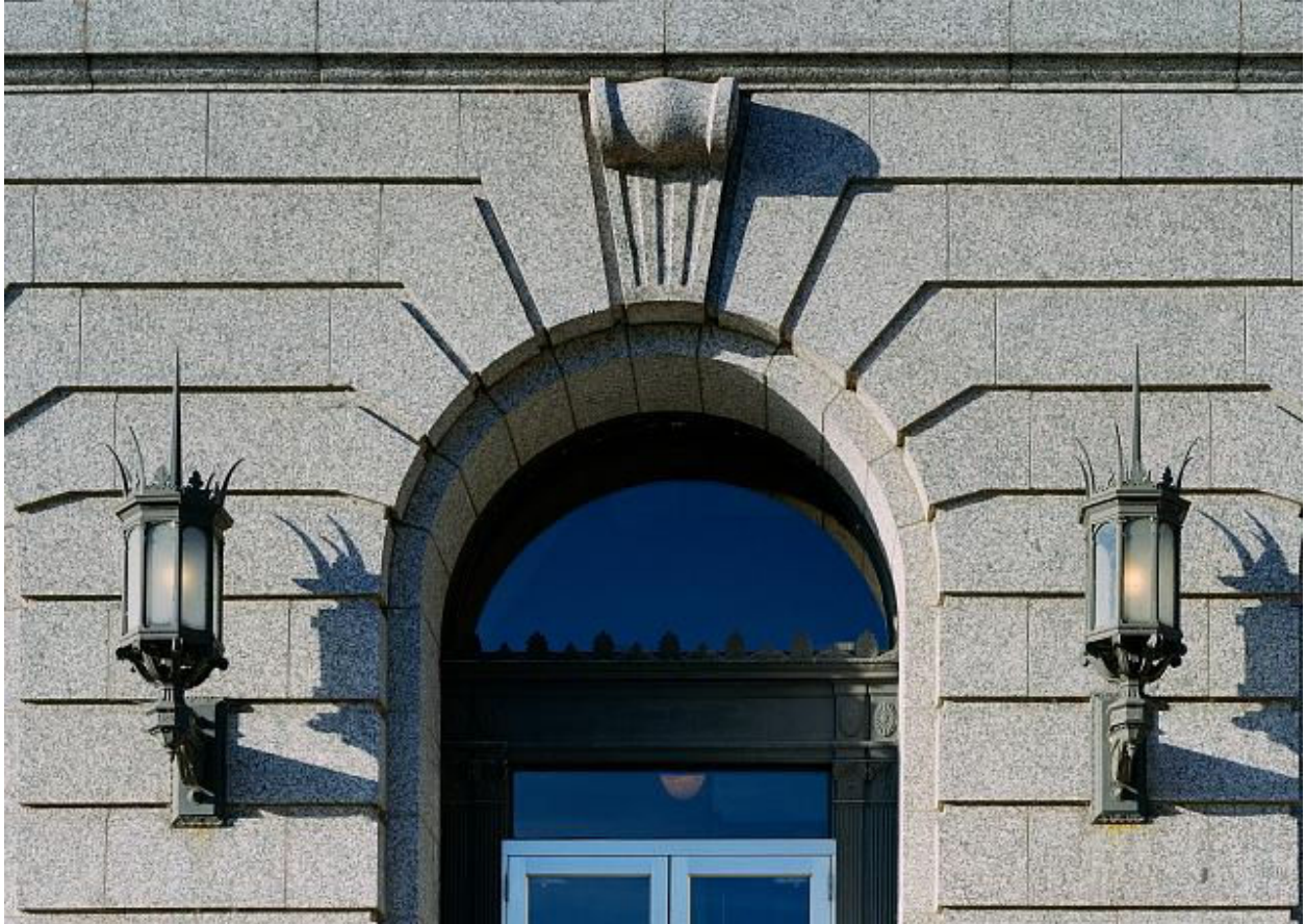
Front exterior detail of the Federal Building & U. S. Courthouse Duluth, Minnesota Image taken September 23, 2005, by Carol M. Highsmith Source: Library of Congress