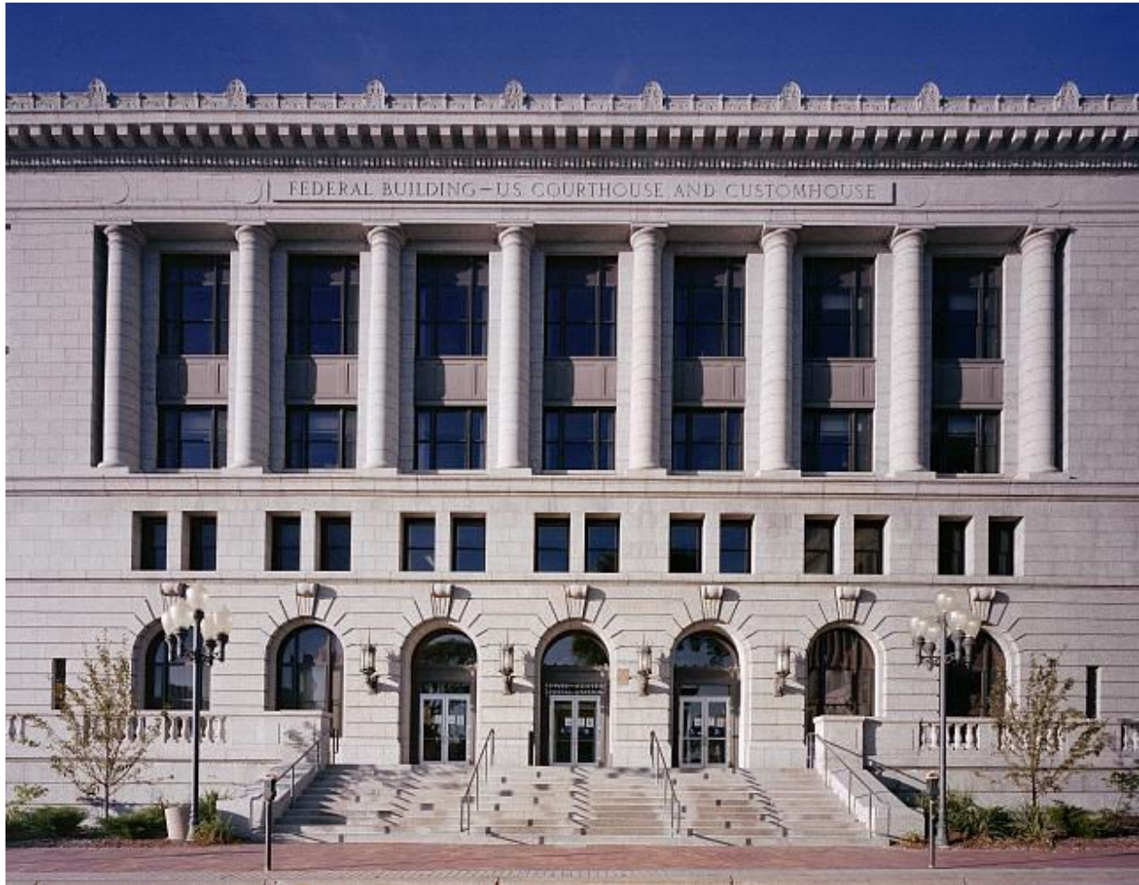
Front exterior of the Federal Building & U.S. Courthouse 515 West Fourth Street Duluth, Minnesota Building completed in October 1930 Image taken September 23, 2005, by Carol M. Highsmith Source: Library of Congress