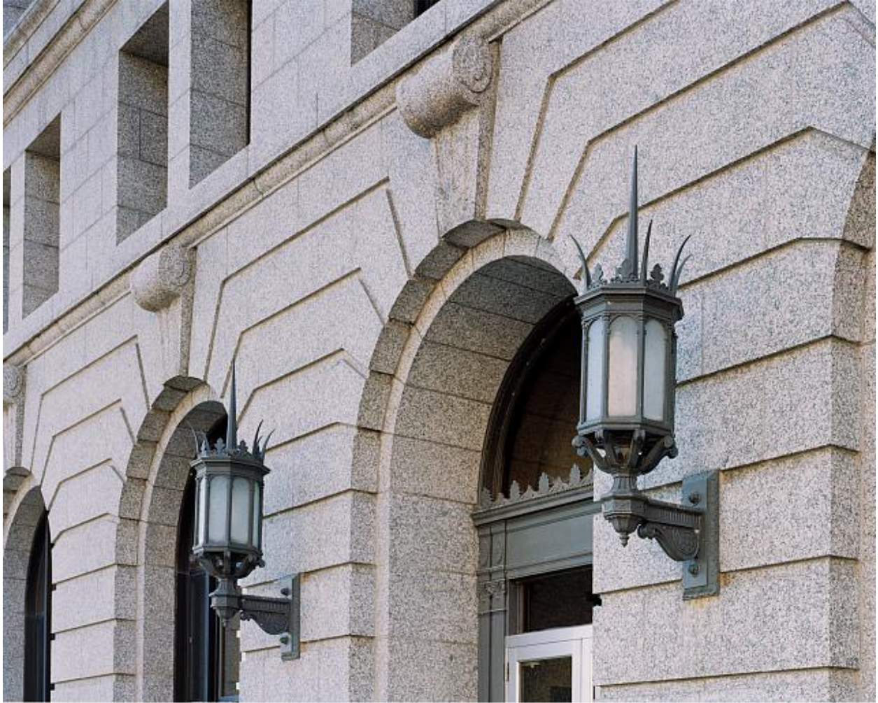
Front exterior detail of the Gerald W. Heaney Federal Building Duluth, Minnesota