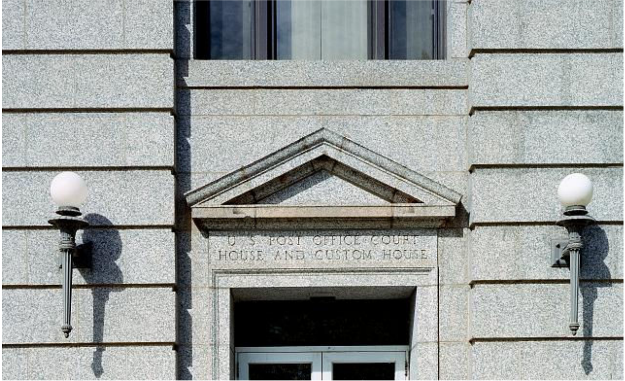
Side exterior detail Federal Building, U. S. Courthouse & Custom House Duluth, Minnesota Image taken September 23, 2005, by Carol M. Highsmith Source: Library of Congress