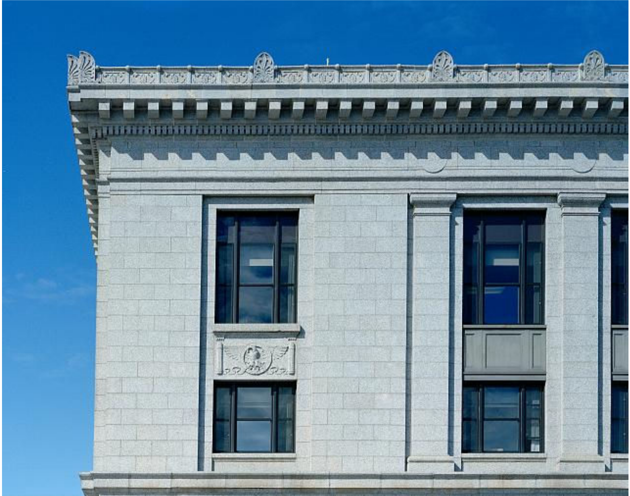
Rear exterior detail of the Federal Building, U. S. Courthouse & Custom House, Duluth, Minnesota Image taken September 23, 2005, by Carol M. Highsmith Source: Library of Congress