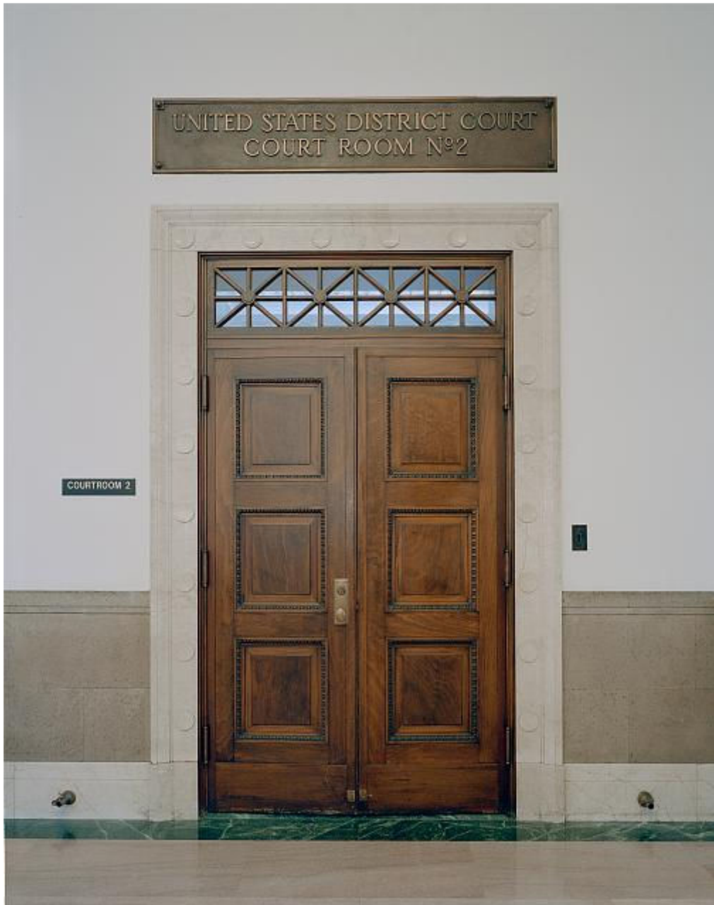
Interior Courtroom Door The Gerald W. Heaney Federal Building, U.S. Courthouse & Custom House Duluth, Minnesota