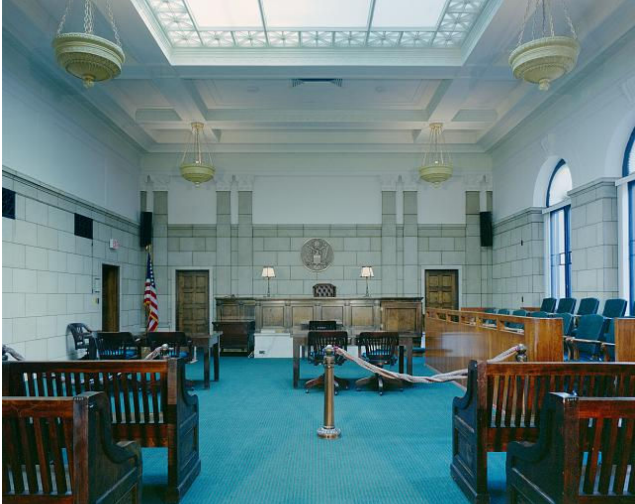
Courtroom The Federal Building, U.S. Courthouse & Custom House Duluth, Minnesota