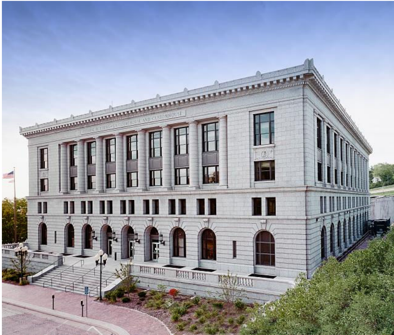
Front exterior of the Gerald W. Heaney Federal Building, U. S. Courthouse & Custom House, Duluth, Minnesota