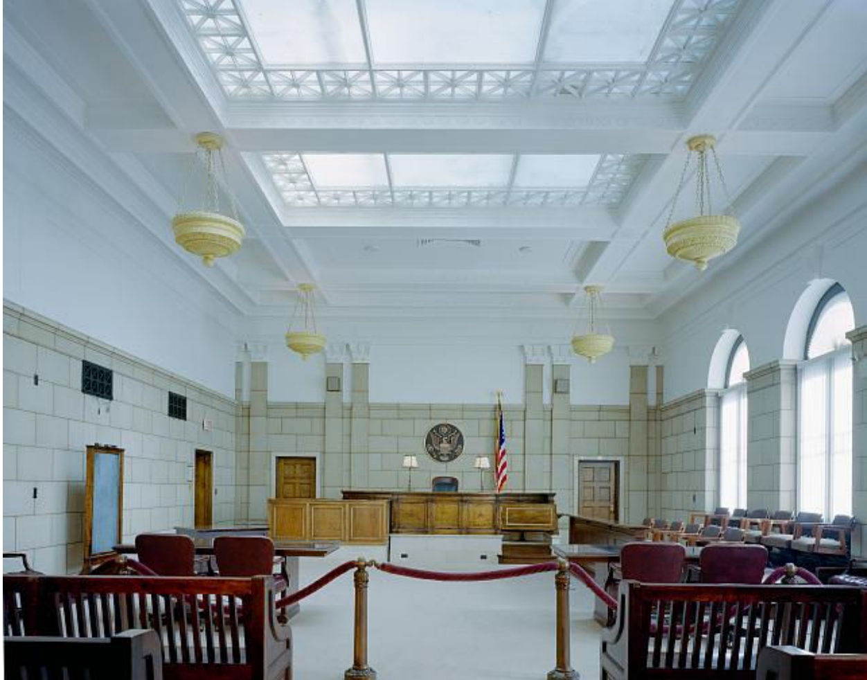
Courtroom The Gerald W. Heaney Federal Building Duluth, Minnesota