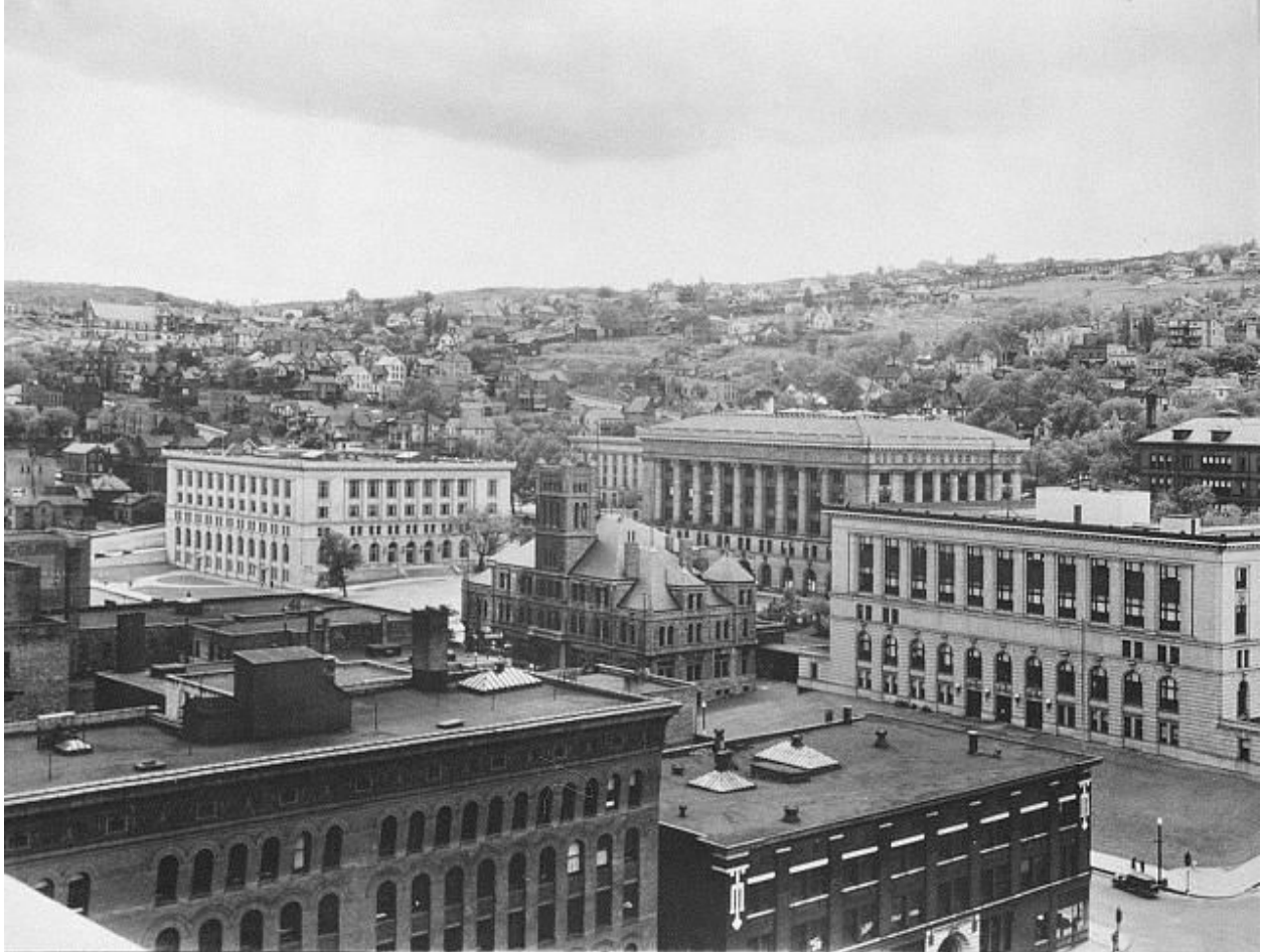
Federal Building & U.S. Courthouse 515 West Fourth Street, Duluth, Minnesota Architect: James A. Wetmore Building completed in October 1930 when this image was taken